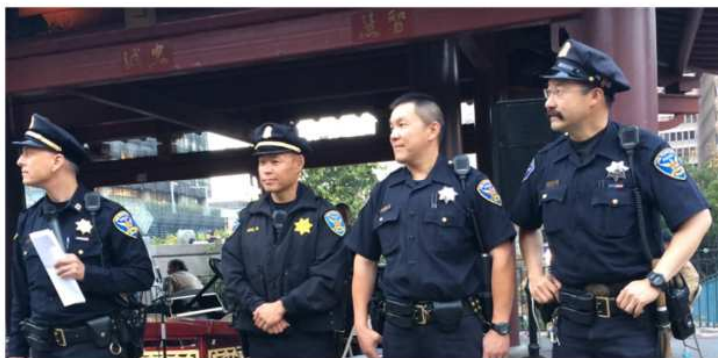
Chinatown Night Out 2014