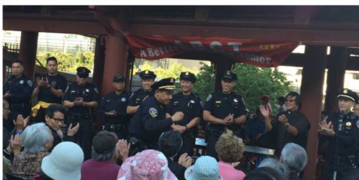
Chinatown Night Out 2015