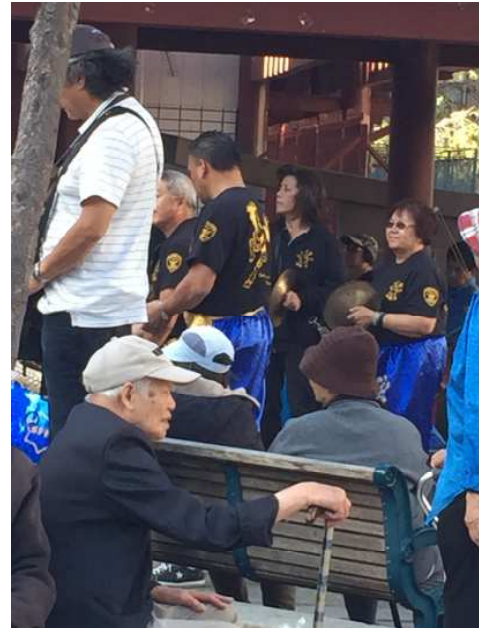
Lion Dance performed by the SFPD Lion Dance Team