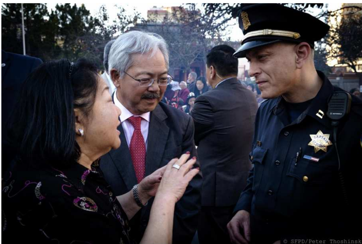
Photo taken at Chinatown Night Out, Tuesday, September 6, 2016.